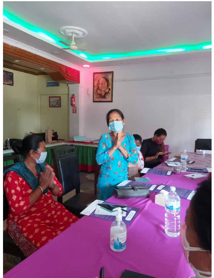
Sharing energy and solidarity to amplify women's voices

With the aspiration of improving their life, migrant women in Nepal endured the difficult working conditions overseas. In the FPAR, it shows that some returnees are economically empowered after returning to their home country. However, there are significant numbers of returnees who have found their life not improved after they returned to their home country. Some came back without any savings and found difficulties reintegrating into society. Up to half of the interviewees continued to experience domestic violence after they returned home. One of the interviewees shared that, “Even though I came back from Saudi Arabia, my life is still the same. Nothing has changed. I still don't have enough to eat, and I experience domestic violence.”