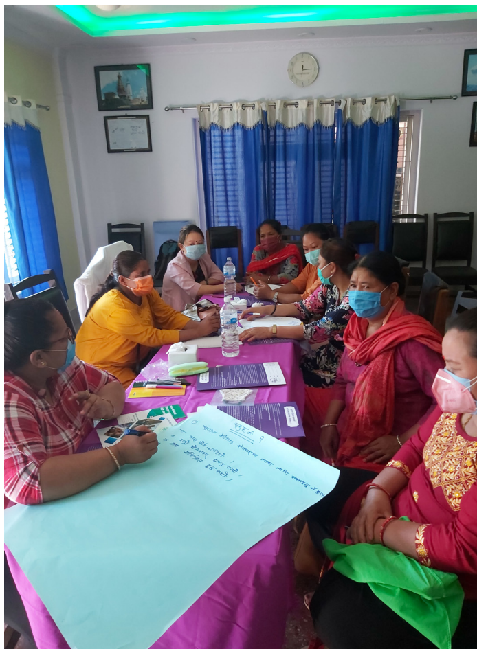
Capacity building on Safe Migration process

The Migration Feminist Participatory Action Research (FPAR) was conducted by Aaprabasi Mahila Kamdar Samuha (AMKAS) to identify the impact of the travel restriction and ban policies on women's foreign employment, and mobilise returnee women migrant workers to abolish the ban and achieve safe migration as a fundamental human right. This FPAR was based on focus group discussions, in-depth interviews and observations of more than 100 returnees migrant domestic workers in Sunsari, Nepal, between March 2020 and January 2021. The majority of the interviewees are Janajati, the indigenous community in Nepal, with an age range from 20-40 years old. Three returnee women joined as co-researchers to engage with the community, conduct the interviews and participate in the FPAR journey.